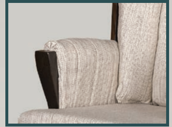
• Padded Arms