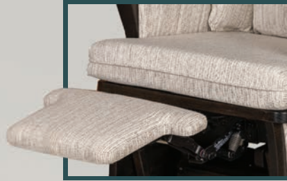
• Flipout Footrest