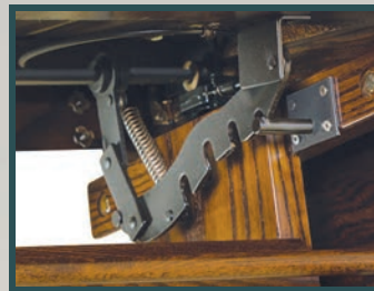
• Locking Mechanism