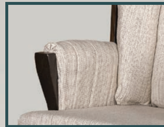
• Padded Arms