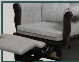
• Flipout Footrest