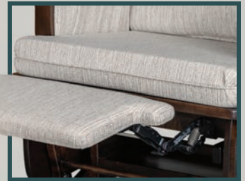
• Flipout Footrest