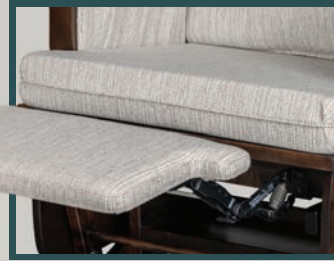
• Flipout Footrest