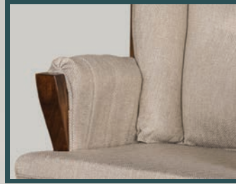
• Padded Arms