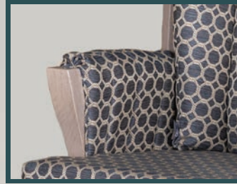
• Padded Arms