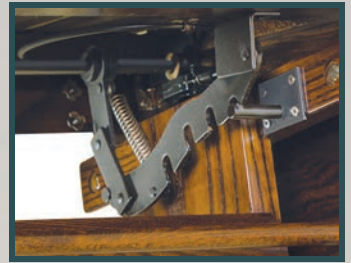
• Locking Mechanism