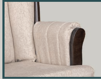
• Padded Arms