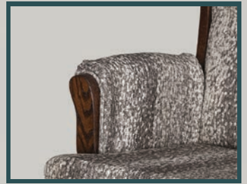
• Padded Arms