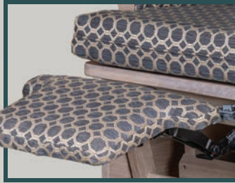
• Flipout Footrest