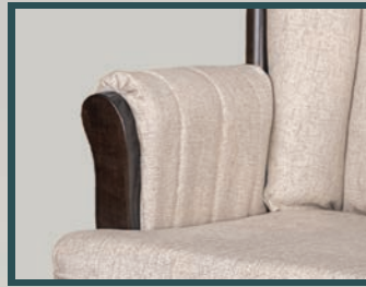
• Padded Arms