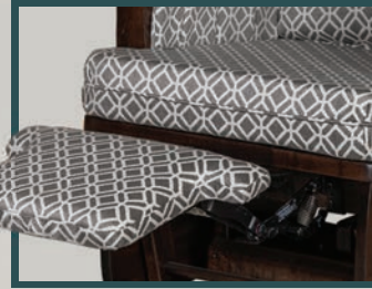
• Flipout Footrest