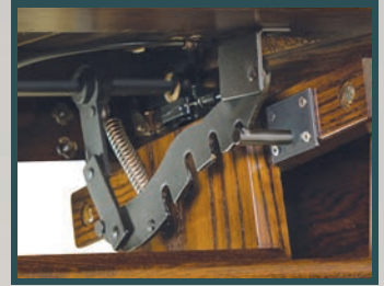
• Locking Mechanism