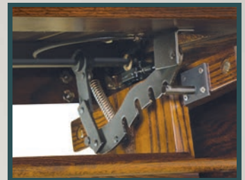
• Locking Mechanism