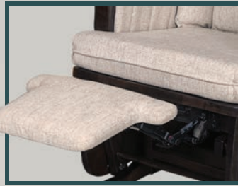
• Flipout Footrest