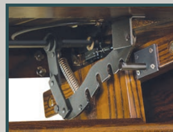
• Locking Mechanism