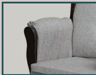
• Padded Armrest