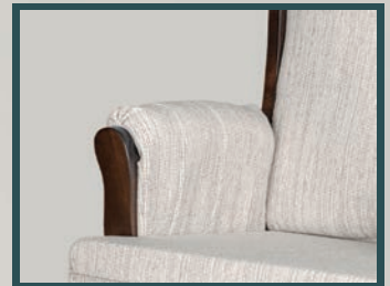
• Padded Armrest