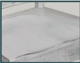
Scooped Wood Seat