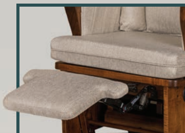
• Flipout Footrest

Wood: Brown Maple Stain: Vintage Antique Fabric: R1-8 Topioca