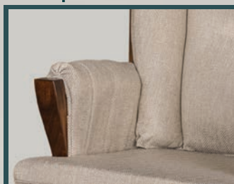
• Padded Arms