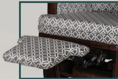
• Flipout Footrest