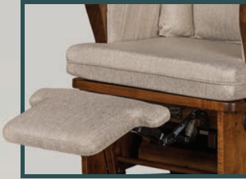
• Flipout Footrest