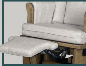
• Flipout Footrest