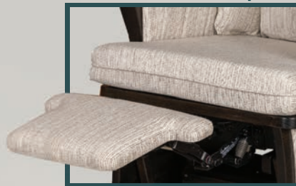
• Flipout Footrest