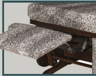
• Flipout Footrest