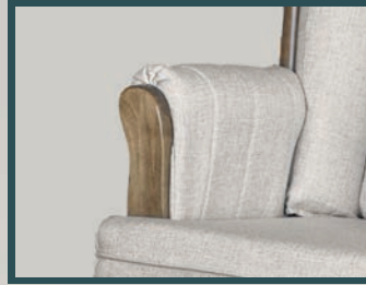
• Padded Arms