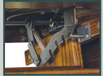
• Locking Mechanism